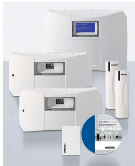
Entro starter kit